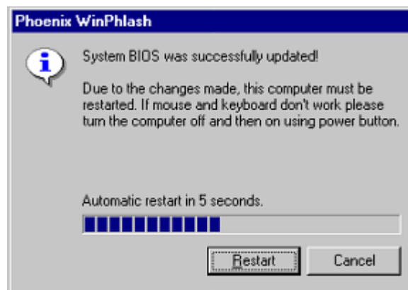
Figure 2-3 System Reboot Dialog Box

If you are backing up and upgrading (flashing) your BIOS, the program then displays the following dialog box announcing the impending reboot of the system: