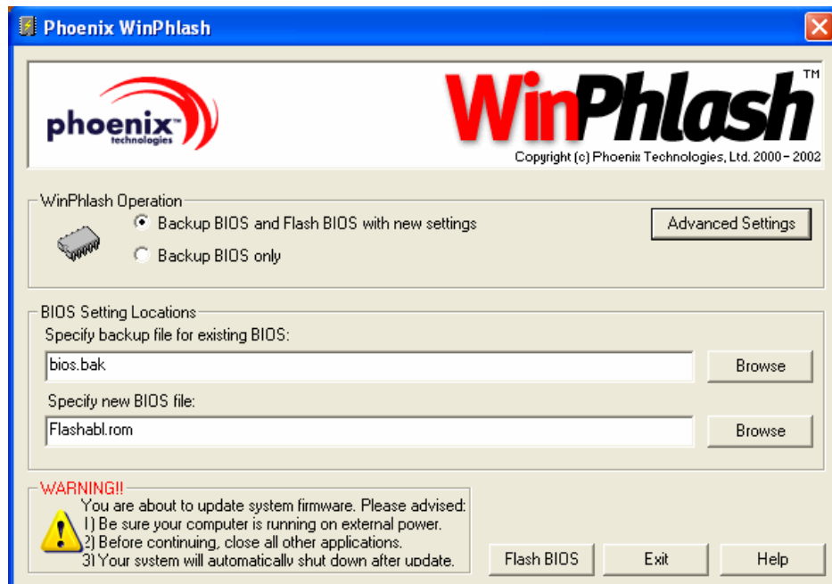
Figure 2-1 WinPhlash Main Window

Note: The main window of WinPhlash is not displayed if WinPhlash is run on the command line with the /P option. Refer to the Command prompt operation section in this chapter.